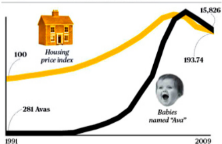
Fig.3 DID AVAS CAUSE THE U.S. HOUSING BUBBLE?

Causality and the Notion of Ceteris Paribus