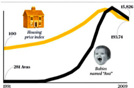
Fig.3 DID AVAS CAUSE THE U.S. HOUSING BUBBLE?

Causality and the Notion of Ceteris Paribus